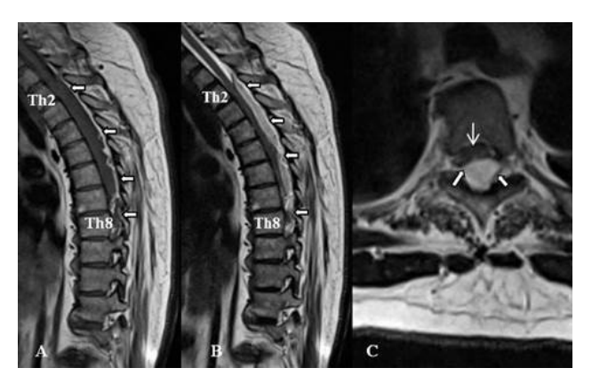
Fig. 1. A patient with PSEA on the level of T2–T8. A) Sagittal T1 MRI shows an isodense lesion lesion at the level of T2–T8 (arrows); B) Sagittal T2 MRI demonstrates epidural abscess in the affected segments (arrows); C) Axial T2 MRI shows the dorsal localization of the abscess (black and white arrows) which compresses the spinal cord (white arrow).

The current study established that the incidence of SEA