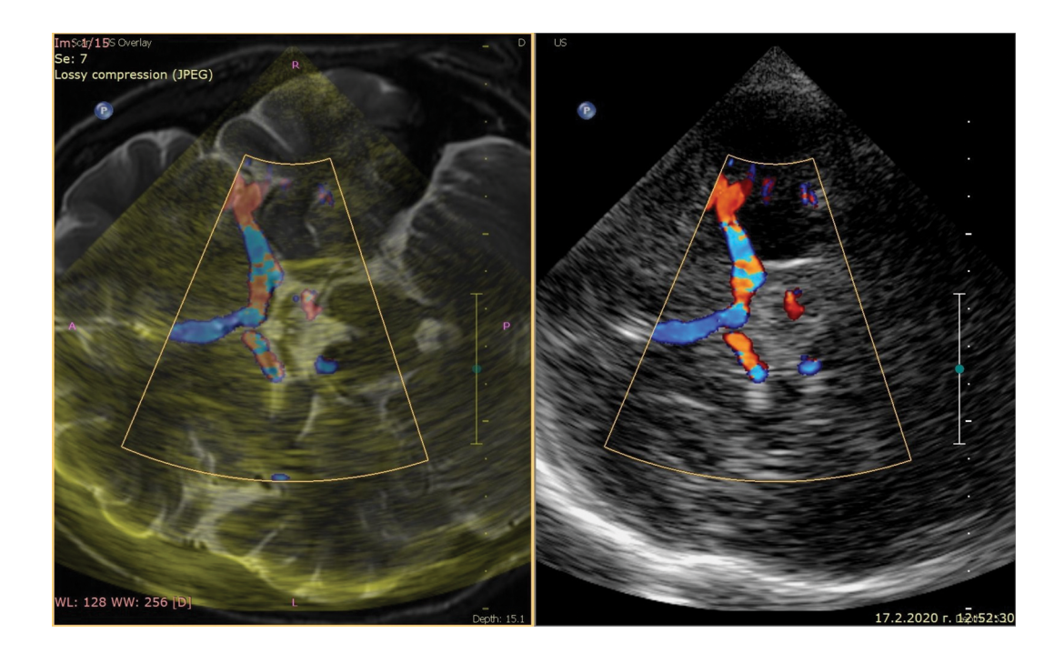
Figure 1. Ultrasound fusion imaging: transtemporal axial insonation plane of transcranial colour-coded sonography: combined US/3T weighted MR image on the left and ultrasound image on the right.

The fusion technique was first used for abdominal investigations and ultrasound guided biopsy of suspicious lesions.<sup>[1,2]</sup> US fusion imaging can also be associated with