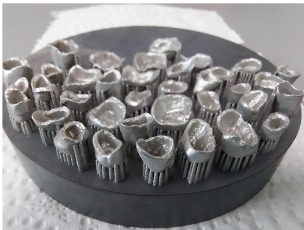
Figure 2. 3D printed metal copings.

The tests were conducted in the morning. Before the measurements, patients were instructed not to consume any food or drink other than water. The corrosion resistance of the alloy in clinical conditions was assessed according to the values of the open circuit potentials (Eocp) appearing between the visible metal edge of the PFM crown and the gingiva at a distance of 2-4 mm using a Dentotest Six