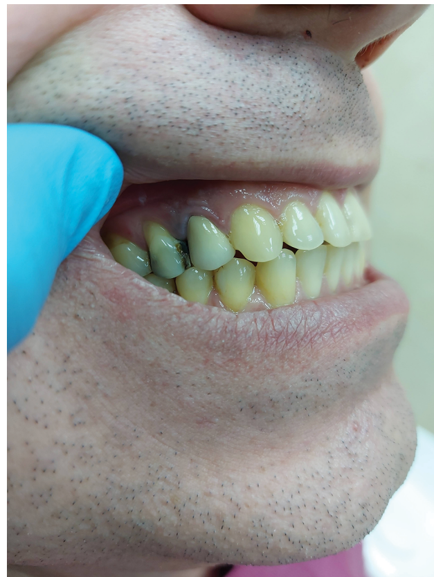
Figure 4. A PFM crown on tooth 14.

apparatus (Atlantis, Bulgaria). The apparatus was calibrated with a voltage calibrator FLUKE SLK 753 and was approved by the standard ISO 13485 (CE 2274). The measurements were conducted 2 hours after fixing the crowns into the patients' oral cavities and after a period of 7 days.