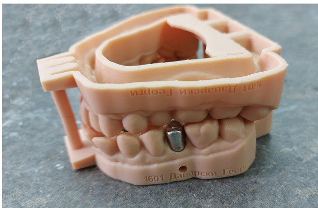
Figure 3. A metal coping on a 3D printed resin model.