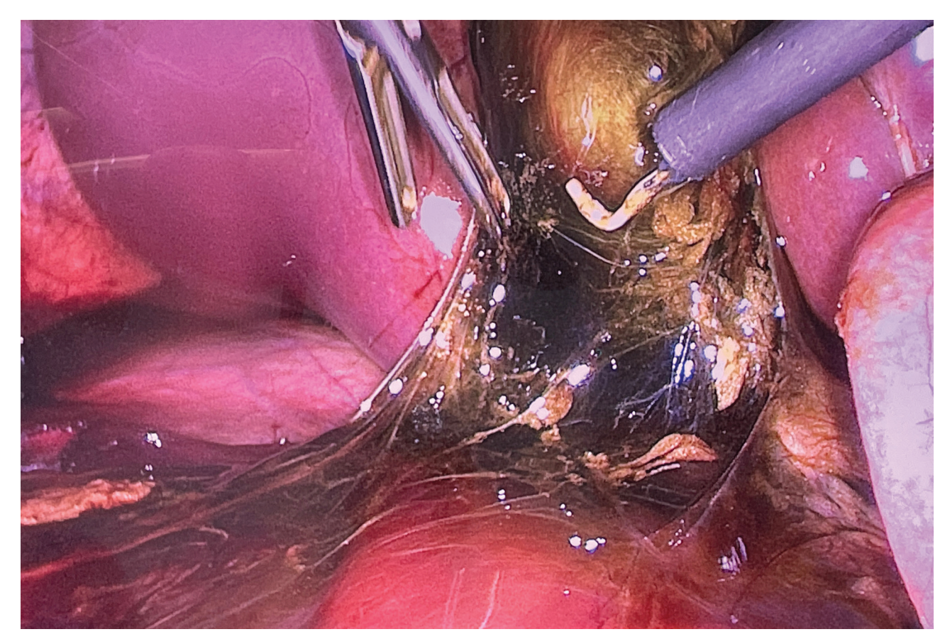
Figure 2. Intraoperative picture of the gallbladder's bed.

this injury and the lack of knowledge and training among specialists. [9]