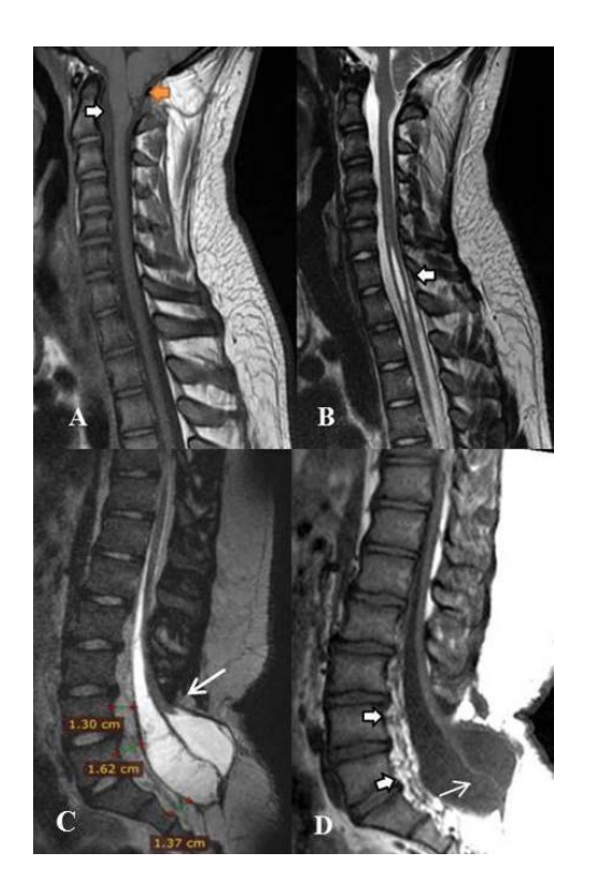
Figure 1. MRI of the craniovertebral junction and lumbosacral region: A) Sagittal T1-weighted image of craniovertebral junction showing low lying brainstem (black and white arrow) and herniation of the cerebellar tonsils in the great occipital foramen (orange arrow); B) Sagittal T2-weighted image demonstrating syrinx at C6-T1 spinal levels (black and white arrow); C) Sagittal T2-weighted image – tethered spinal cord ending at L4-L5 spinal level (white arrow) and presence of epidural lipomatosis D) Sagittal T1-weighted image – cystic formation compressing filum terminale (white arrow), epidural lipomatosis dislocating posteriorly the spinal cord (black and white arrows).

There are several theories that discuss the formation of CMII but none of them thoroughly explains all associated anomalies.<sup>4</sup> The theory of hindbrain disgenesia as a result of MM clarifies the alterations in the posterior cranial fossa but not those affecting the supratentorial space.<sup>4</sup> Accord-