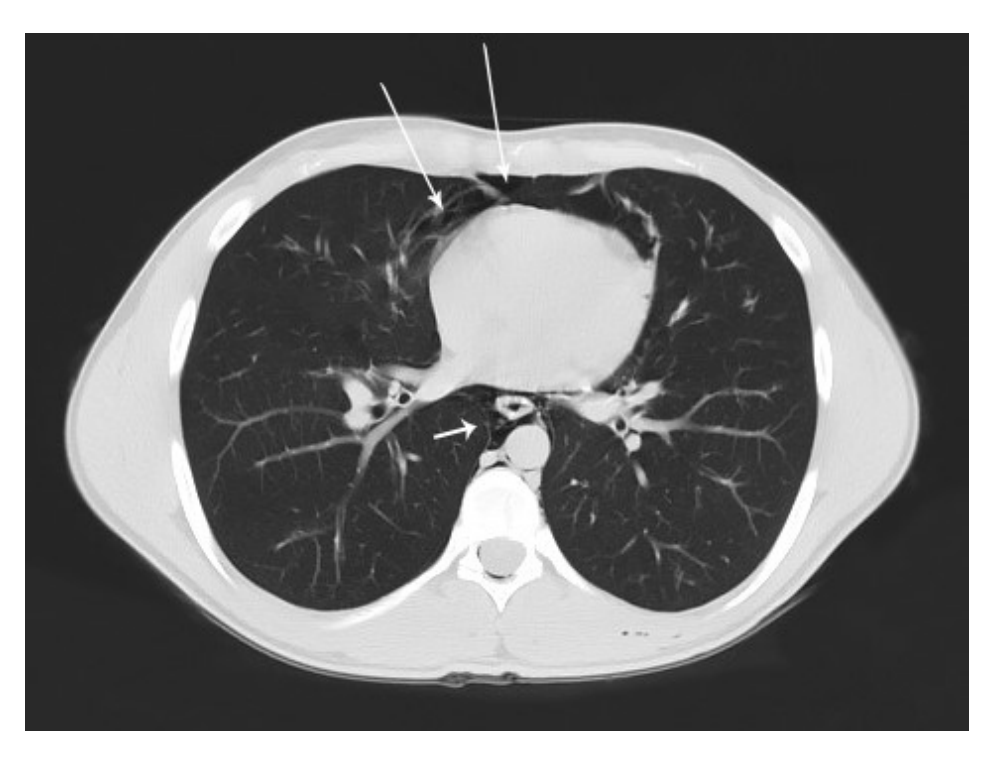
Figure 3. HRCT of the patient. Arrows show area of pneumomediastinum.

condition is more predominant in males (57%–87%).<sup>7,9</sup> The medical history predisposing to the development of spontaneous pneumomediastinum includes smoking in 29%-34.1% cases, asthma in 14%–21.9%, idiopathic pulmonary fibrosis in 7%, and chronic obstructive pulmonary disease in 4%.9 Nevertheless, the condition can be associated with a variety of other diseases including the use of drugs, perforation of the esophagus and even perforation of sigmoid diverticulus.<sup>7,10</sup> Clinical symptoms include chest pain 54%-59.5%, dyspnea 25.5%-39%, cough 32%-32.5%, subcutaneous emphysema 32%-42.9%, odynophagia 4%, neck swelling 14%, pneumothorax 7%.<sup>9,11</sup> Hamman's sign (crunching sign over the precordial area synchronous with heartbeats) is present in approximately 20% of patients.<sup>12</sup> In children, cough (81%), dyspnea (75%), and chest pain (56%) are the predominant symptoms and expiratory wheezing (63%) and neck crepitus (50%) are the most common physical findings.<sup>13</sup> In more than a half of the cases there is no precipitating factors (51.2% of cases). Other common precipitating factors may include physical exercise in 12.2% of cases, vomiting in 9.8%, cough in 7.3%, and infection of the upper airways in 7.3% of cases.<sup>7</sup>