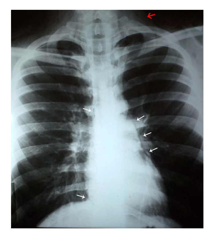
Figure 1. Chest X-ray of the patient. Red arrow – subcutaneous emphysema, white arrows – pneumomediastinum.

A 20-year-old male patient presented to the emergency department with chest pain, productive cough, hoarseness and neck edema. The symptoms started during an asthma attack accompanied with dyspnea and cough. Due to the increase in symptoms, the relatives called an ambulance and he was admitted to the hospital. The patient was diagnosed with asthma at the age of 7 and at the point of admission he was receiving fluticasone propionate 500 mcg/salmeterol 50 mcg