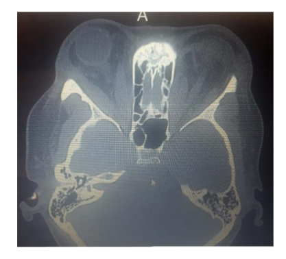
Figure 3. CT imaging identifying enlarged extraocular muscles and proptosis.