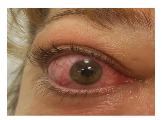
Figure 1. Image of our patient showing active disease as manifested by eyelid hyperemia, eyelid edema, conjunctival injection, and caruncular edema.

py, and showed values of 26 mm Hg for the right eye and 21 mm Hg for the left eye, measured by Goldman tonometry in the first position of the eyeball. Upon looking upwards at 30°, higher IOP values were found (27 mm Hg for the right eye