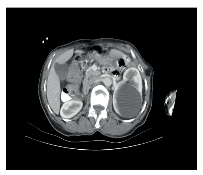
Figure 1. Image of the cyst on computed tomography.