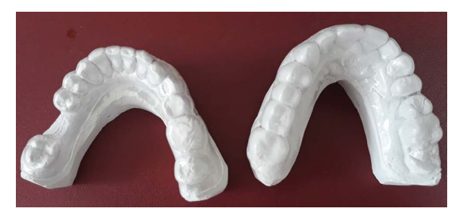
Figure 3. Study models with custom trays.

The patient was instructed to cover all internal surfaces on the split with topical corticosteroid (clobetasol propionate 0.05%, dermovate cream).