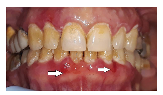
Figure 1. Initial clinical appearance – arrows show intact bullae eruption, filled with hemorrhagic fluid.

Intraoral examination revealed diffuse gingival inflammation with mild edema and evidence of erosion in the region of right upper lateral incisor and two intact hemorrhagic bullae in the region of lower lateral incisors. Heavy plaque accumulation was present around the teeth and gingival bleeding occurred with the slightest provocation with a periodontal probe (Fig. 1). Gentle manipulation of gingiva induced bulla formation in the marginal and papillary gingiva (positive Nikolsky sign). Upon physical examination, the patient presented a good health, with no evidence of other lesions in her