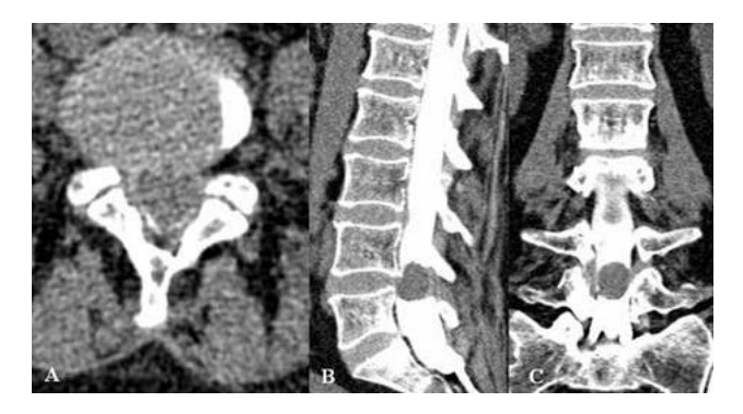
Figure 3. CT-assisted myelography with axial, sagittal and coronal reconstruction, demonstrating lumbar meningioma at L4-L5 level (A-C).

for such type of tumor.<sup>31</sup> Generally, SMs are smooth and fibrous with crumbly content. The epidural space is well defined, which is why the involvement of bone structures is rarely observed in SM.