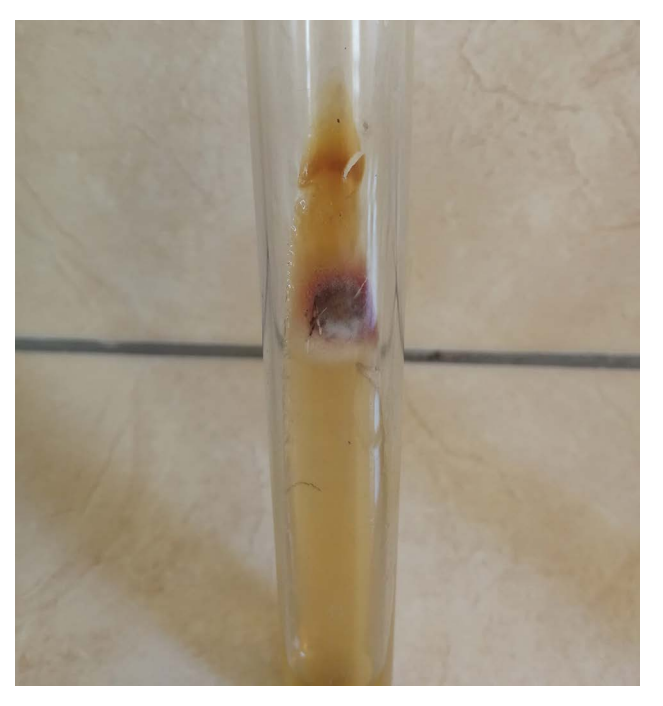
Figure 6. Culture from the beard.