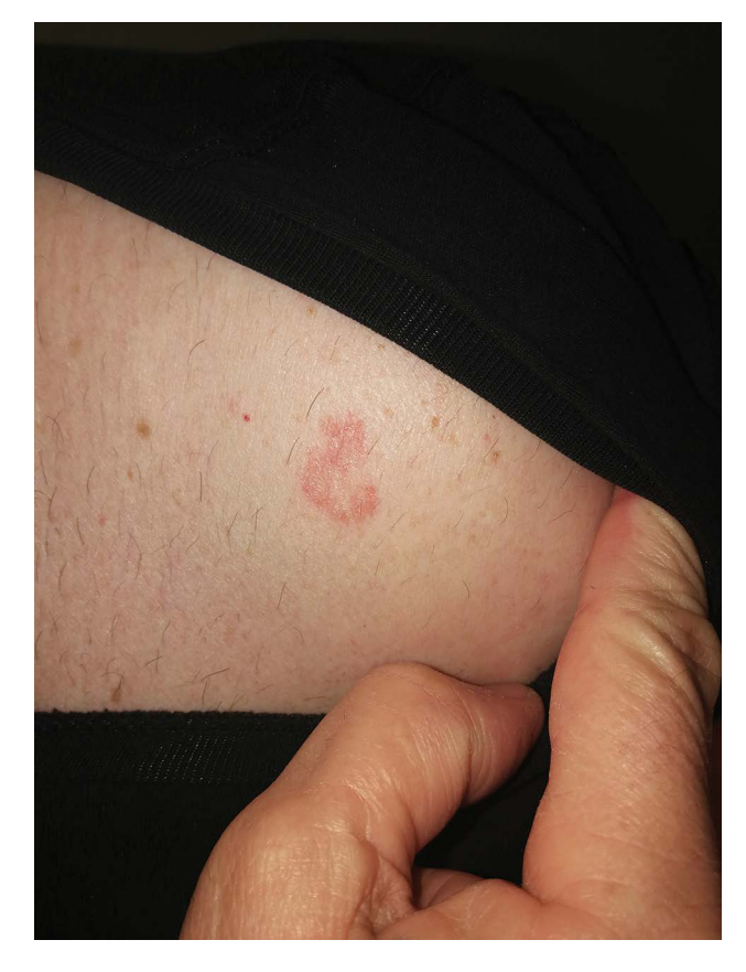
Figure 3. Left shoulder of the patient.