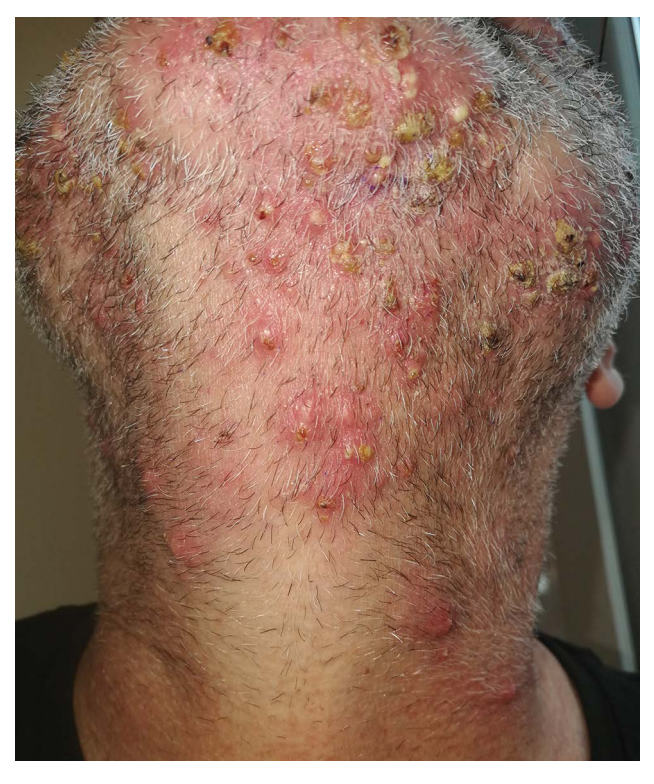
Figure 1. Beard (bottom view).

Tinea barbae is a rare fungal infection, especially in urbanized areas and in healthy males.<sup>1-3</sup> Predisposing factors which favour the development of the disease are severe concomitant diseases such as diabetes mellitus, congenital or acquired immunodeficiencies, previous corticosteroid therapy (systemic or topical), and contact with animals and/or people suffering from the infection.<sup>3</sup> It is also characteris-