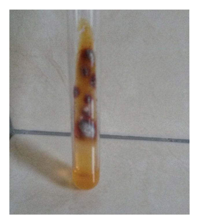
Figure 8. Culture from between the toes.

tic for agricultural workers, stockbreeders, and immunocompromised subjects.<sup>5-7</sup> It is usually caused by zoophilic species, Microsporum canis , Trichophyton verrucosum , and Trichophyton mentagrophytes .<sup>1,2,8</sup> In very rare cases, tinea barbae can be caused by anthropophilic types of dermatophytes. T. rubrum is the most common representative