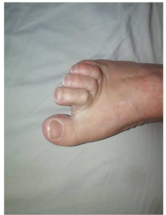
Figure 5. Right foot of the patient.