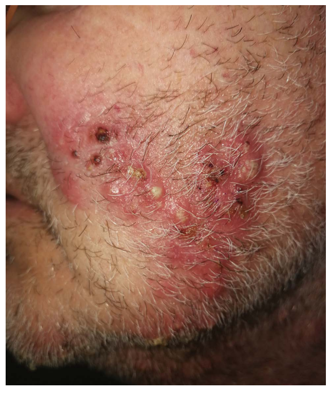
Figure 2. Beard of the patient (side view).