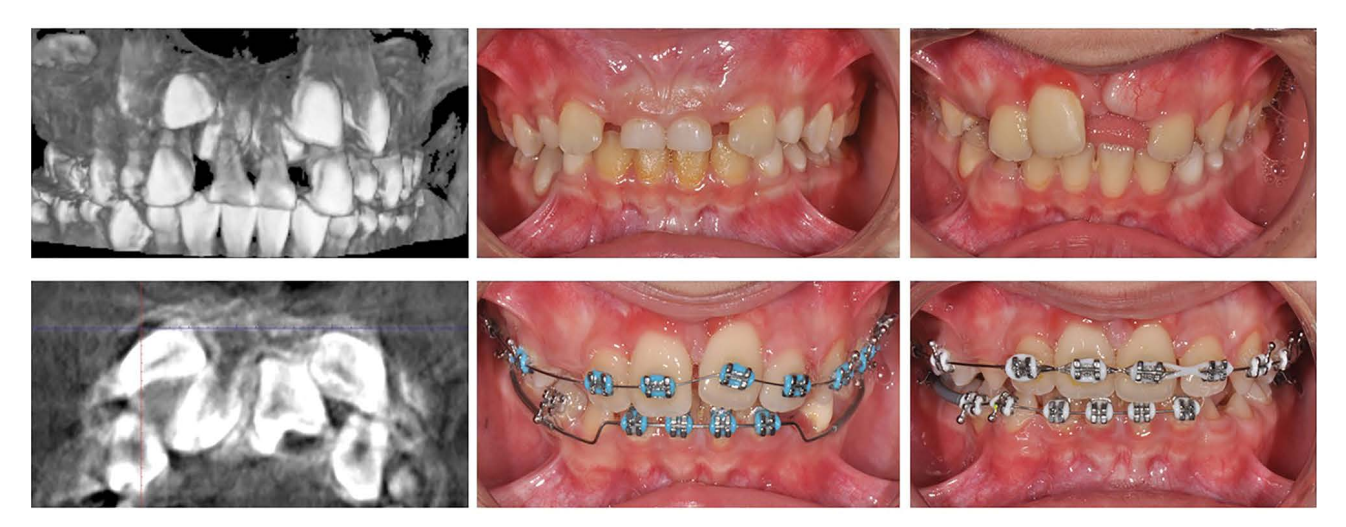
Figure 3. Central incisors, with palatal position, with underdeveloped roots and altered shape of crowns. The right one is pig-shaped, and the left one has a premolar shape. The two well-developed central incisors are located over the lateral incisors. They erupted spontaneously after extraction of supernumerary teeth.