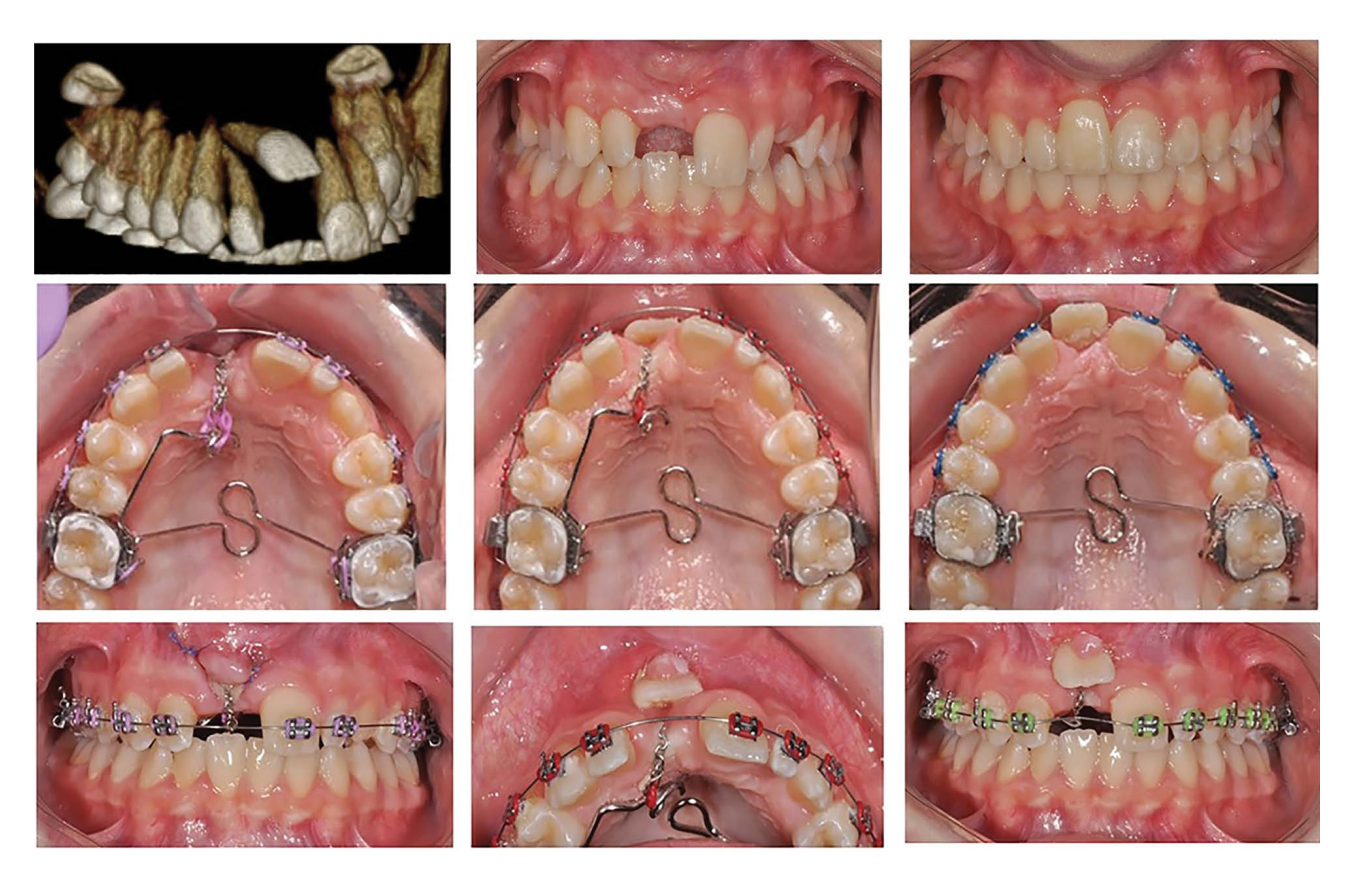
Figure 2. Treatment protocol using the palatal arch.

The extender arm increases the elastic properties of the arch and, at the same time, assures good support. The preposition of the teeth with its most bone surrounding location in the alveolar ridge assures predictable vertical traction when included to the vestibular fixed technique. Using this kind of treatment protocol, we can be sure to achieve good aesthetics, gingival zenith of the teeth and alignment in the upper dental arch.