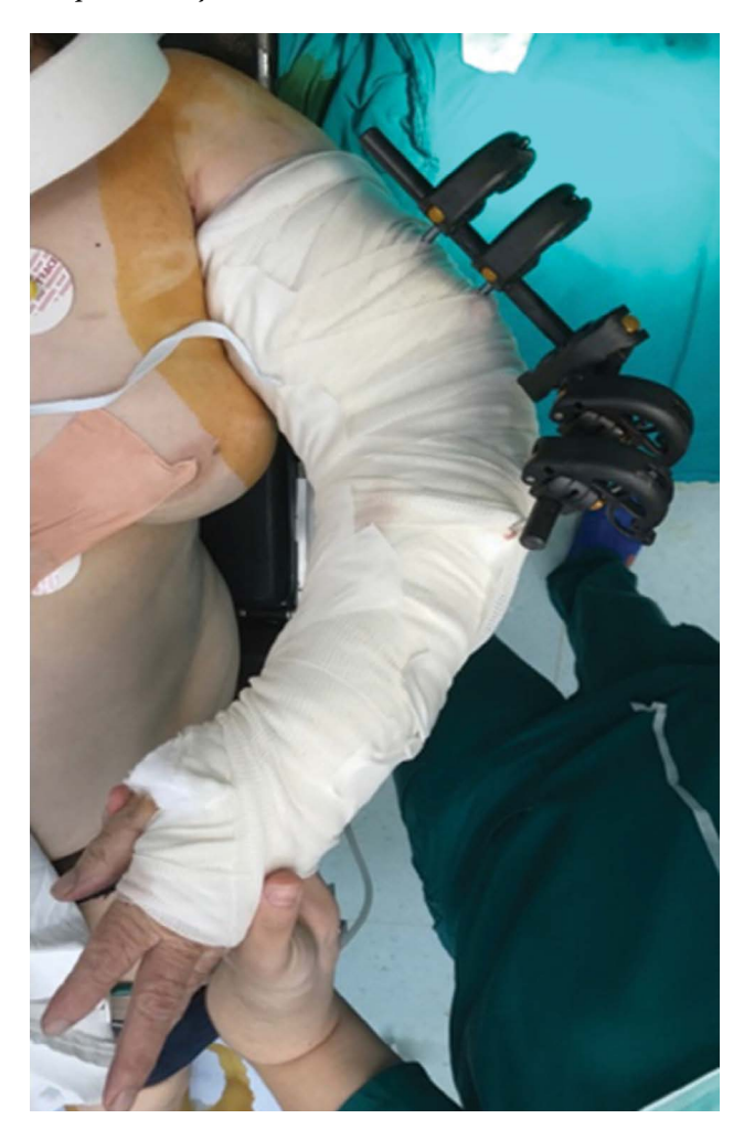
Figure 5. Postoperative imaging showing humeroulnar external fixation and final closure, without a cast.

restoration to the hand. A 90° humeroulnar external fixation was placed to ensure maximum stability ( Fig. 5 ). At the end of the procedure, fasciotomies of forearm compartments were performed prophylactically due to the high risk of developing compartment syndrome.