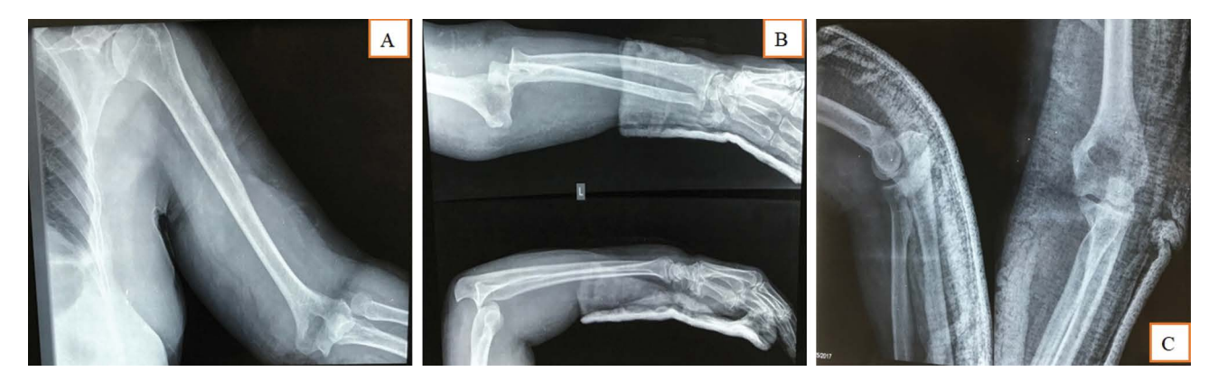
Figure 1. A. Radiographic image of shoulder, humerus and misdiagnosed dislocation of elbow; B . Radiographic image of immobilization of a wrist injury with cast and misdiagnosed dislocation of elbow; C . An image of closed reduction of elbow and cast immobilization.

Under general anesthesia, the patient was positioned in the supine position. The arm rested on the side table with the shoulder in abduction and external rotation, and the elbow in extension. On intraoperative examination after performing a lazy 'S' incision through an anterolateral approach to the elbow, a pulsating tubular structure with occluded lumen was noted, raising the suspicion of a complete brachial artery rupture (Fig. 3). After hematoma removal, a complete disruption of the brachial artery was revealed with lacerated distal and proximal vessel ends and incomplete homeostasis by internal stagnation thrombus (Fig. 4A). Arterial reconstruction followed by performing excision of the injured arterial segment and bridging the arterial defect using a reversed brachio-brachial venous bypass (ipsilateral distal cephalic vein) (Fig. 4B). Intraoperatively, biphasic Doppler signals in both radial and ulnar arteries along with palpable pulses confirmed the patency of the graft and the physiologic blood