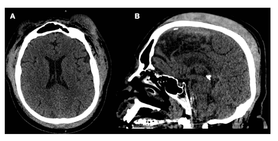
Figure 1. Head computed tomography (CT) showing extensive subgaleal hematoma (hyperattenuating content) in axial (A) and sagittal (B) planes, associated with soft tissues edema in adjacent face but without intraparenchymal or subcortical contusion or associated with skull fractures.

The subgaleal space is of major clinical significance because many emissary veins pass through this areolar