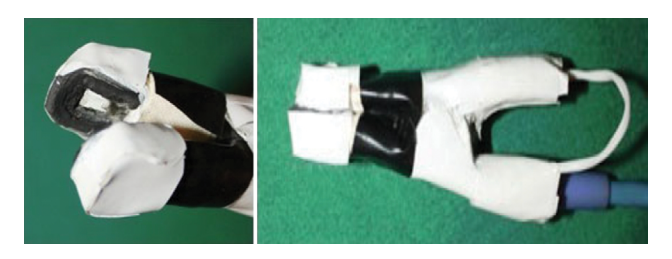
Figure 2. Custom-made sensor holder.

The pulse oximeter used in this study was Alborz B5 ( Masimo SET/SAADAT , Iran ) and the FMT-RAF-MSM-L sensor ( Metko Ltd,. Istanbul, Turkey ) which had a modified shape for use on teeth ( Figs 2, 3 ).<sup>11</sup>