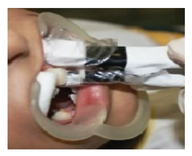
Figure 3. Sensor holder on patient's tooth (Courtesy of Dr. Bargrizan).

The patients were instructed not to move their head during the test. A disposable clear plastic cover was used for the sensor. The patient's lips were retracted and the tooth was isolated by cotton rolls. The sensor was placed on the respective tooth so that the sending diode was on the buccal surface and the receiving diode was on the palatal surface as parallel. During the test, the probe was maintained still. The oxygen saturation rate displayed on