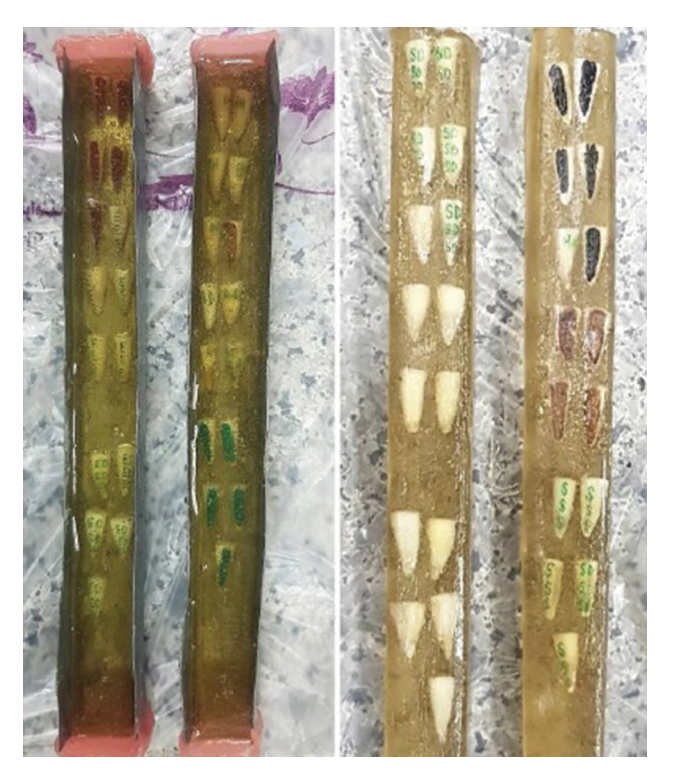
Figure 1. Samples mounting in a polyester material.

Tescan, Czech Republic) for the penetration of sealers into the dentinal tubules directly by quantitative measurement at \times 50–2500 magnification. The sealers' penetration depths were determined at four points in each cross-section (in each area of the surfaces mentioned, the sealers' dentin penetration was evaluated at three levels; therefore, in each tooth section, the penetration was evaluated at 12 points) ( Fig. 3 ). Therefore in each group 15 sections and 180 scenograms were evaluated. Finally, the deepest sealer penetration of each surface was determined at each coronal, middle, and apical section in µm. The operator carrying out SEM evaluations and the statistician were blinded to the study group allocations (a double-blind scheme).