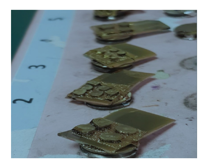
Figure 2. Samples preparation for SEM evaluation.