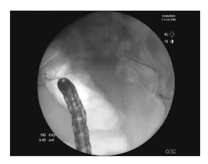
Figure 3. Abdominal radiography confirming the position of the SEMS.