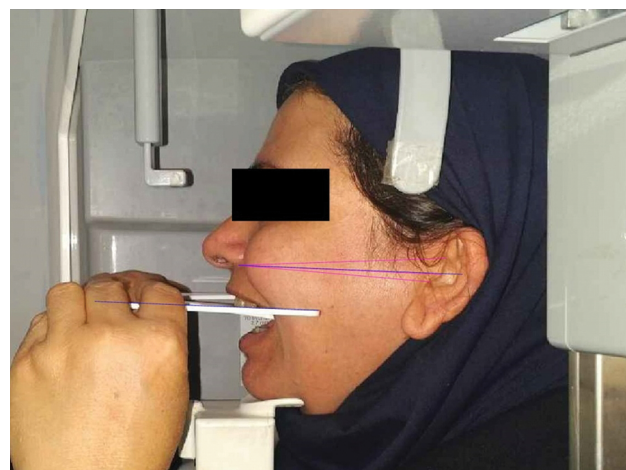
Figure 1. Different tragus lines plan.

A sterilized Fox plane was held in touch with the incisal edge of maxillary central incisors and first molar palatal cusps while the head was stabilized in chin part of panoramic radiographic system, and the Frankfort plane was kept parallel with the horizontal plane. This adjustment was confirmed using a horizontal line traced on the wall behind the patient's head. The Frankfort plane was kept parallel to the line by looking through the camera at the level of the mentioned line. Lateral photographs were taken from 1-meter distance, perpendicular to profile and at proper height for every participant. The position and distance of each patient's head was adjusted by the fixed distance between the chin positioner of panoramic system and the camera. Afterwards, three lines were traced by Auto-cad software (Autodesk Inc., California, USA) connecting inferior border of ala to either inferior, middle, or superior border of tragus on each photograph ( Fig. 1 ). Auto-cad data were analyzed by SPSS (SPSS Inc, Illinois, Chicago) using chi-square test, and one-way ANOVA test ( p<0.05 ).