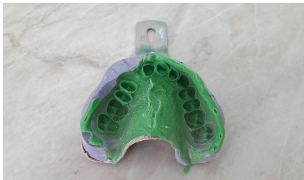
Figure 4. Upper jaw impression.

and lower jaws in the central occlusion, a bite registration was taken with a C-silicone. After that a temporary restoration was made directly in the dental office using Protemp II (3M ESPE, USA). It was cemented using temporary cement until the permanent construction was ready. After the final restoration was made in the dental laboratory, it was adjusted and cemented in the patient's mouth (Figs 5, 6).