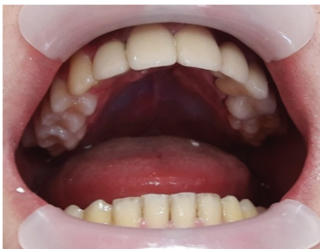
Figure 6. The final construction.