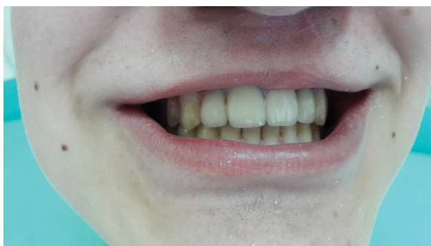
Figure 5. The final cemented prosthetic construction.

and lower jaws in the central occlusion, a bite registration was taken with a C-silicone. After that a temporary restoration was made directly in the dental office using Protemp II (3M ESPE, USA). It was cemented using temporary cement until the permanent construction was ready. After the final restoration was made in the dental laboratory, it was adjusted and cemented in the patient's mouth (Figs 5, 6).