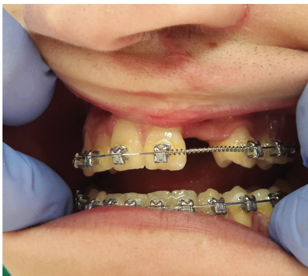
Figure 1. The space between teeth 21 and 24 after the orthodontic treatment.

The impression from the lower jaw was taken with an alginate class A. To record the relationship between the upper