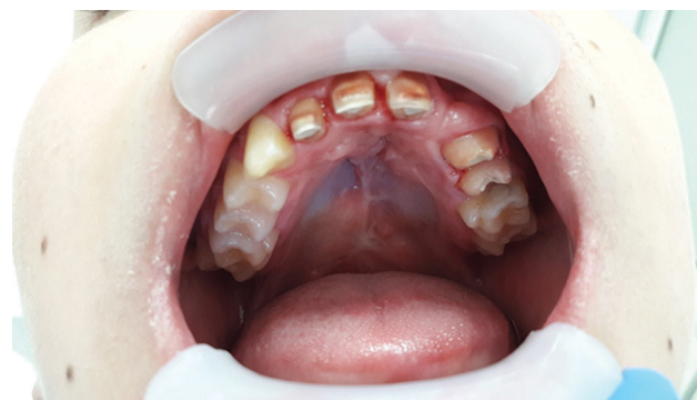
Figure 3. Teeth preparation.